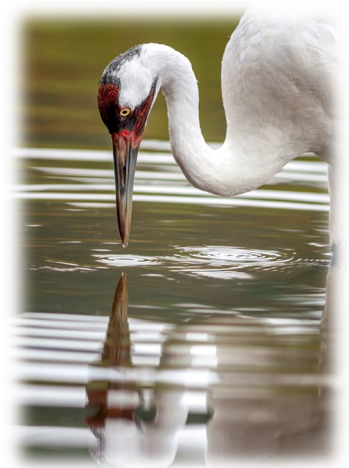
Whooping Crane by Ted Thousand

Close to home, the ICF Baraboo headquarters hosts a captive flock of some 100 cranes, including the only complete collection of all 15 species in the world. The site features live crane exhibits, tours, a research library, visitor center and 4 miles of nature trails. It is visited by more than 25,000 people annually. The prairie, when blooming this time of year, is worth the trip by itself. And the site is a wonderful place to bird anytime. Definitely a destination!