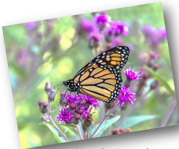
Monarch on Ironweed