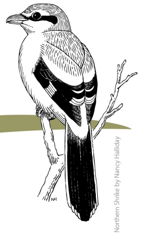
Northern Shrike