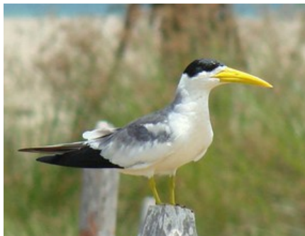
Large-billed Tern

The range of this inland species is tropical South America from Colombia and Trinidad, south to Peru and Argentina, mainly along the sandy banks of South America's great rivers and estuaries. It breeds on sandbanks along large deep rivers.