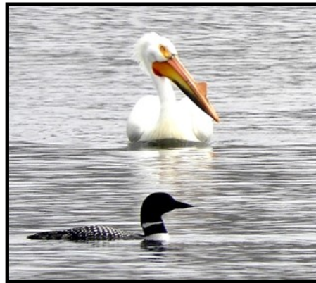
Bluff Lake