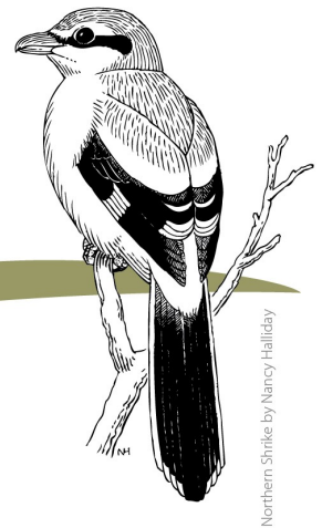
Northern Shrike