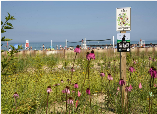
CSBBS