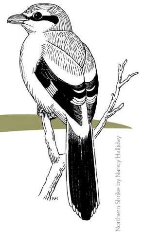
Northern Shrike