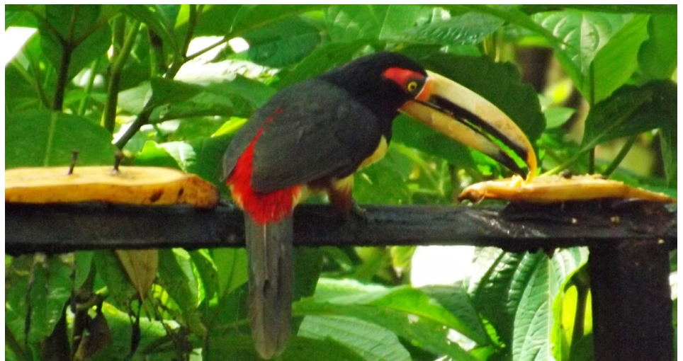
My nonbirder husband was so disappointed to miss this Pale-mandibled Aracari that I genuinely felt sorry for him.

My husband's conclusion: "While 90% of the birds in Chicago are uninteresting, 90% of the birds in Ecuador are interesting." Of course, I don't entirely agree, but if it gets me a ticket to tropical birding, honey, it's all yours.