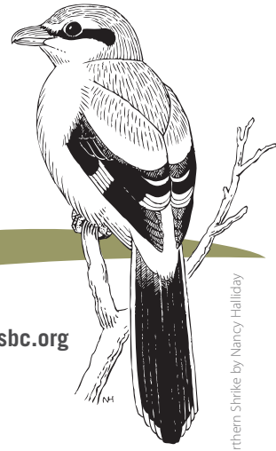
Northern Shrike