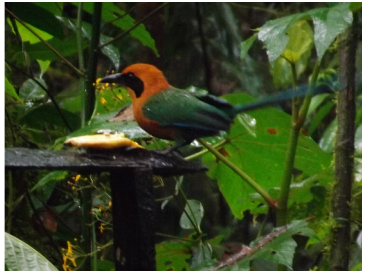
You never forget your first Motmot.

Our first destination was Yanacocha, a temperate forest. It was my husband who first spotted the Sword-billed Hummingbird. I didn't get mine until the end of the trail. He got the Mountain Velvetbreast, a hummingbird with black belly and curved bill. I missed it.